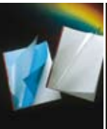
SteelCrystal - SteelMat